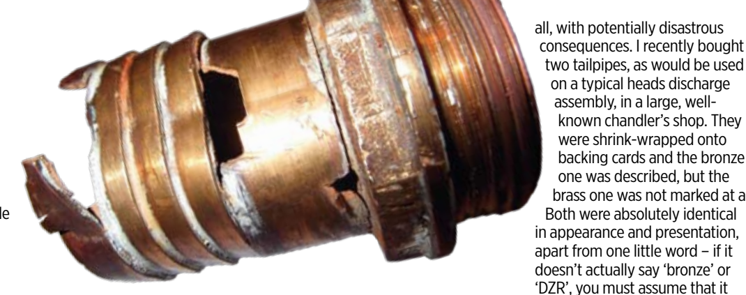
An ordinary brass tailpipe found during the survey of a 10-year-old boat. It was so badly dezincified that the wall simply crumbled under a light tap. The tailpipe was on a cockpit drain always left open. Left like this, it would only be a matter of time before the boat sank.

circumstances, such as current leakage and associated electrolytic action, ordinary brass will probably last the prescribed five years. Brass is about a quarter the cost of bronze or DZR, so the decision to use it is being driven by cost.