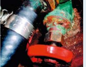
Many used boats have gate valves. This one is terminally corroded

This is a through-hull fitting with a gate valve and a hose tail fitting. They used to be quite widely used, but are