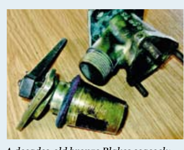
A decades-old bronze Blakes seacock: good for another 30 years or more

In common use for many years, this type has proved extremely reliable. It consists of a tapered, revolving hollow plug with an aperture in the side, located in a body with a matching taper. When the apertures are in line, the seacock is open. Manufactured by Blakes