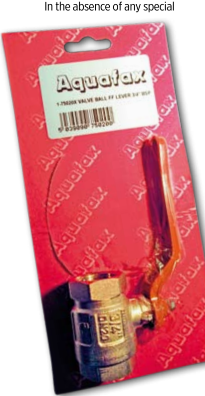
CW617N brass valve - but the marking is on the back of the valve thus not visible in packaging

This is all the more unacceptable because we could be using other materials that are proven to have a life far in excess of five years. In 1980, a British Standards specification was issued for a new type of brass, designated CZ132, which was resistant to dezincification. This is now known as DZR (dezincification-resistant) brass and has the EN designation of CW602N. This material is proven to be the equal of bronze in a saltwater environment and is now in common use. Unfortunately, the other similarity it has with bronze is price.