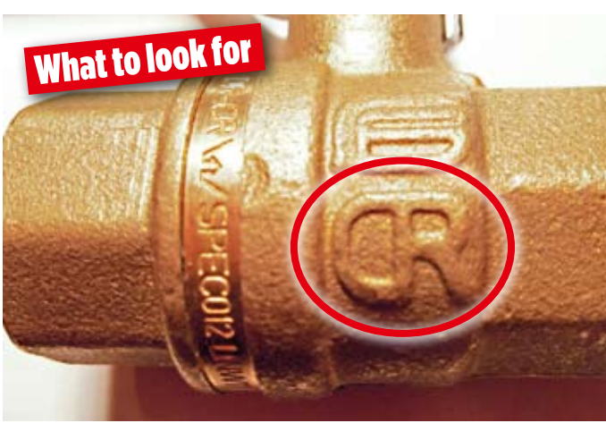
DZR brass ballvalve with 'CR' (corrosion-resistant) marking

'What on earth are we doing using an inferior material for such vital fittings below the waterline?'