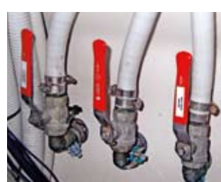
1998 boat built to RCD with non-marine brass values

II boatbuilders used to fit high-quality bronze seacocks and skin fittings because cheaper brass fittings are known to fail, with potentially catastrophic results. Yet in recent years, some of the world's leading boatbuilders have been using ordinary brass fittings below the waterline. These typically consist of 40% zinc and are patently not suitable for use below the waterline. Equally worrying, many yachtsmen, due to lack of advice or good labelling, are buying replacement seacocks made of