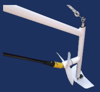
Active dive plane for ease of recovery