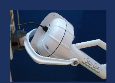
Fully gimbaled mount

For sales and enquiries contact: Eclectic Energy Ltd, Unit 22 Sherwood Networkcentre, Sherwood Energy Village, Ollerton, Nottinghamshire, NG22 9FD United Kingdom Tel: +44 (0) 1623 835400 Fax: +44 (0) 1623 860617 sales@eclectic-energy.co.uk www.eclectic-energy.co.uk