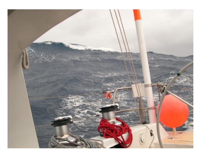
Photo: Cresting wave near the beam. Time to start thinking about altering what we are doing:

There are typically three factors to think about when making this decision: