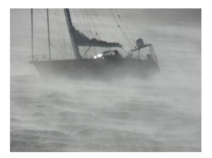
Photo: Strong winds can be hard to judge but at 60kts there is a very visible and distinctive 'phase change', as the surface of the water starts to smoke:

Operationally, if (after balancing the sail plan as well as you can) you are having sustained trouble steering a straight track, or are getting repeatedly thumped hard by waves you are nearing the line.