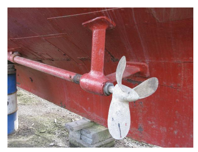
Port propeller, A bracket and shaft