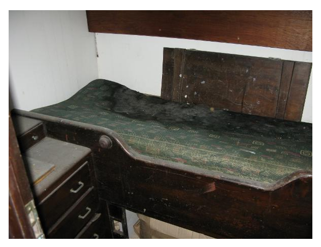
Starboard guest cabin