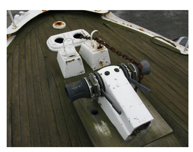
Anchor windlass / capstan