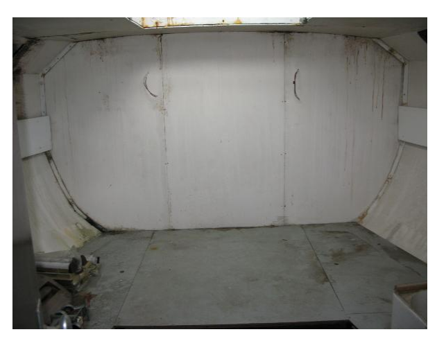
Aft master stateroom