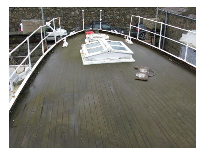
Aft deck and stateroom roof light / ventilation hatch