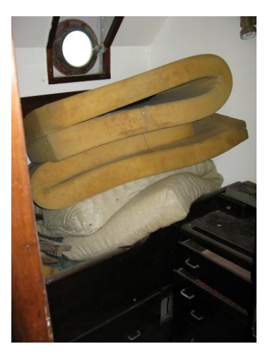
Port guest cabin