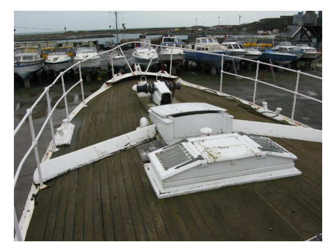
Foredeck, crew cabin access and galley roof light / ventilation hatch