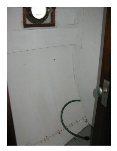
Day / guest heads compartment