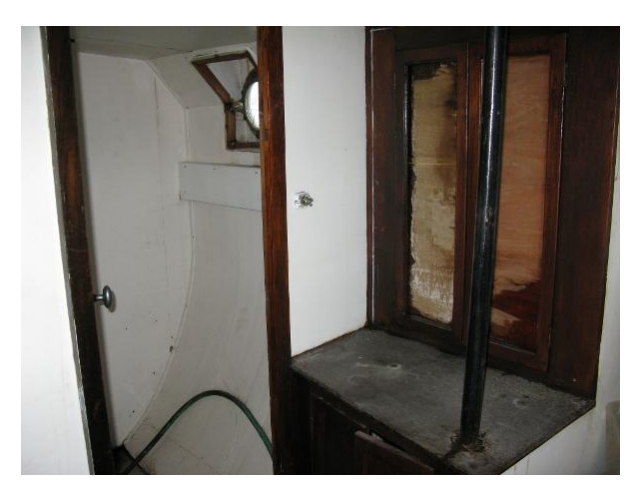
Stateroom vanity unit and en suite heads compartment