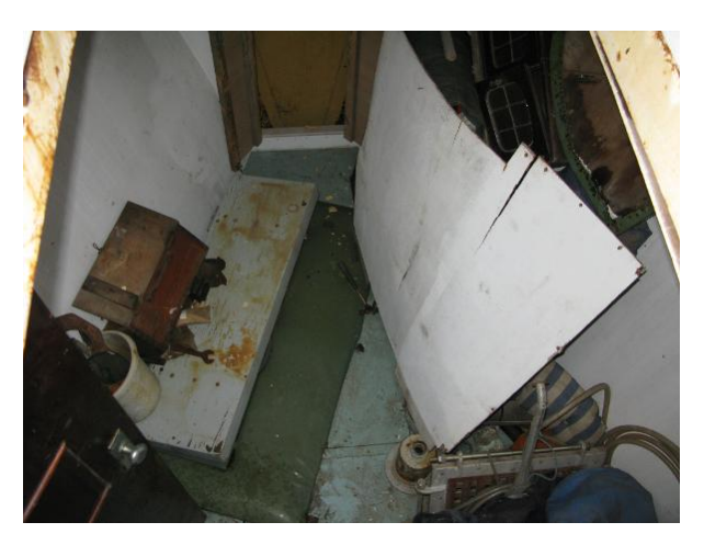
Forward crew cabin / store