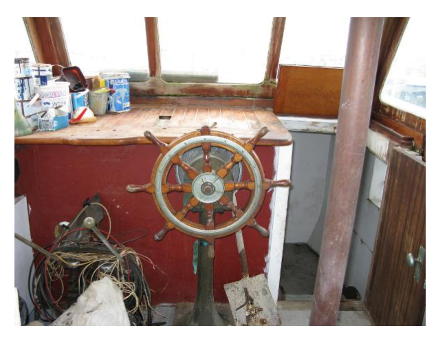
Wheelhouse / deck saloon