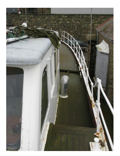
Port side deck