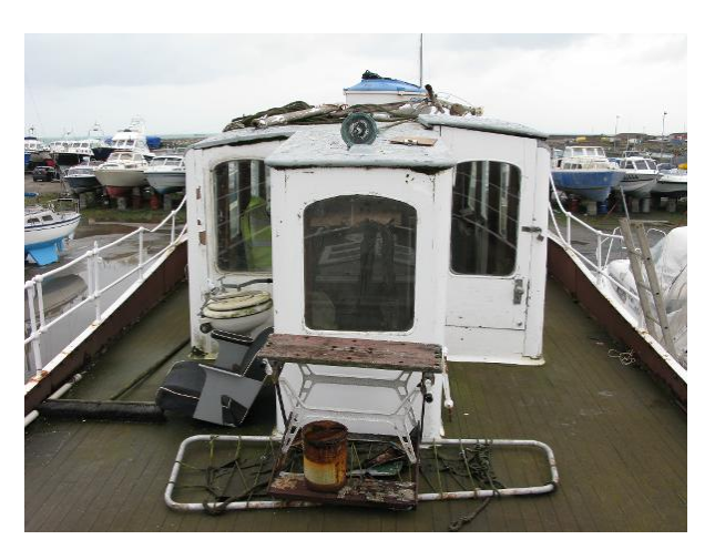
Rear view of wheelhouse