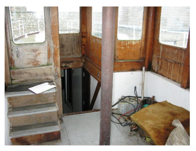
Aft wheelhouse access and companioway