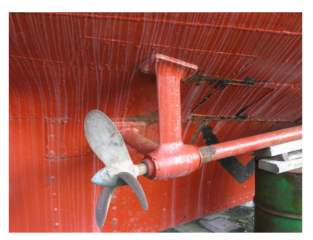
Starboard propeller, A bracket and shaft