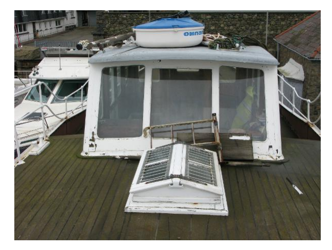
Front view of wheelhouse and saloon deck light / ventilation hatch