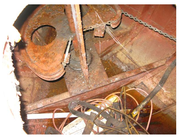
Aft peak / steering compartment