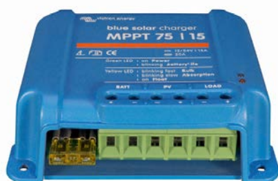
Solar Charge Controller MPPT 75/15