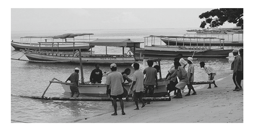
Photo 2.1 A violator's fishing boat confiscated by villagers at Gili Air, Lombok Barat, Indonesia

are fined the equivalent of USD 1,465, and their boats and gears confiscated; and those fishing with potassium cyanide are fined the equivalent of USD 244.