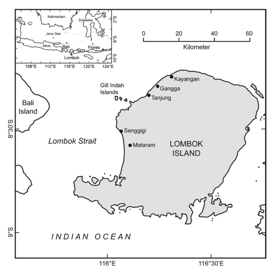
Fig. 2.1 Locations in Lombok Island

beginning of the 'Reform Era' (from 1998 until the present). This was a critical period during which political instability led to a lack of government accountability and authority to enforce formal rules in marine fisheries. The legacy of low enforcement rates was exacerbated by the Reform Era, which in effect created 'stateless areas' throughout much of Indonesia. Local people took advantage of that political vacuum to assume a new role as 'regulators'. The phenomenon of self-regulation in marine fisheries enabled them to replace various formal rules by revitalizing their own pre-existing institutions. As a consequence, following the recognition of increasing use of destructive fishing practices, especially blast fishing, in Lombok Barat local people decided to replace the formal rules for fisheries by revitalizing awig—awig (Satria and Matsuda 2004a).<sup>2</sup>